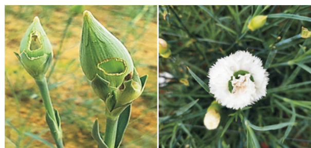
Fig. 2. Damaged flower buds and borer resting and feeding on flowers of carnation cv. Chabaud Mix

started declining as the crop started to senesce, and the number of buds decreased after blooming.